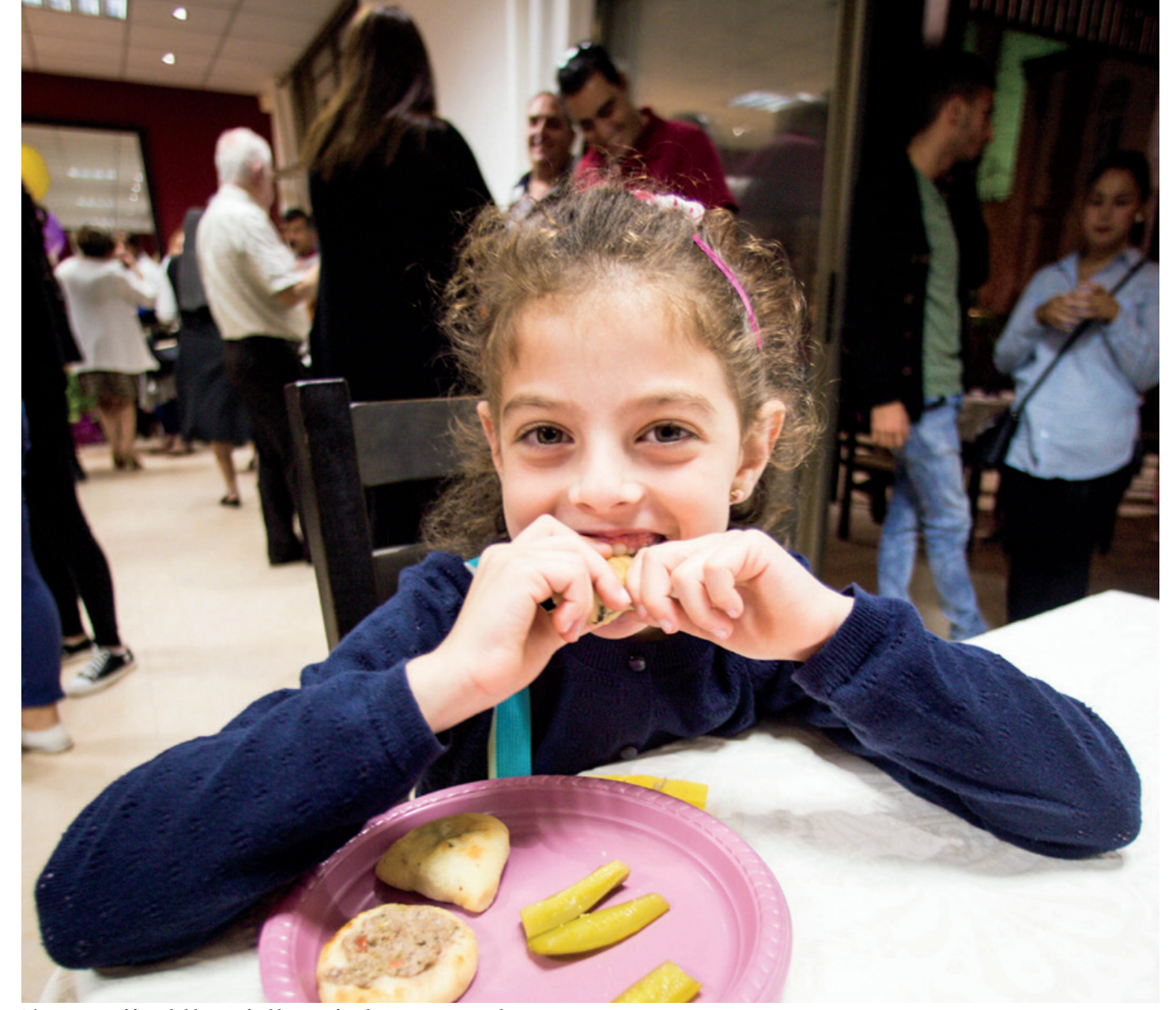
The support of friends like you feed hungry families nutritious meals.

It can get expensive to take care of all the children, and now at age